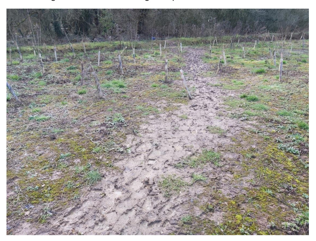
Fragile nature of a wet meadow habitat:

Route through 10m buffer zone from gate in post and wire fence: