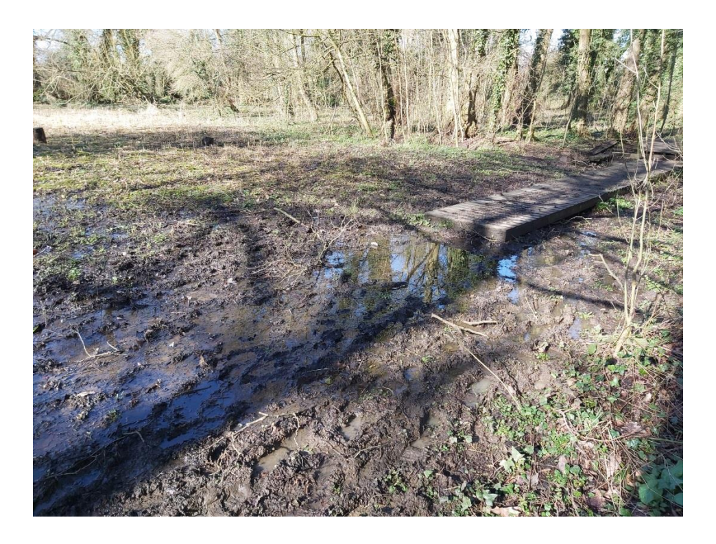
This is an example where walkers have created a new path to avoid the boggy area:

This can be demonstrated in this photograph where the footpath comes off the end of the boardwalk into the meadow: